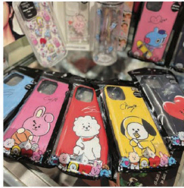
• K-pop Friends BT21 phone cases

K-pop fans, unite! K-pop Friends is coming to Royal Hawaiian Center this August bringing high-quality K-pop and K-drama inspired gifts, merchandise, and memorabilia to Waikiki. Here, shoppers can find iconic K-pop light stick in support of their favorite band. K-pop Friends also offers a diverse selection of albums, the perfect addition to any summer jams collection. Open daily 11:00am-9:00pm. Building C, Level 1. Follow K-pop Friends on Instagram @kpopfriendshawaii.