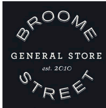
• Broome St. General will open at the Royal Hawaiian Center in August.

This August, Broome St. General will open its very first Hawaii location, featuring a curated selection of luxury goods from around the world. The gourmet grocery store offers specialty foods, coffees, teas and read-made bites amid home décor and other accessories. Open daily 11:00am-9:00pm. Building B, Level 1. Follow Broome St. General on Instagram @broomestgeneralwaikiki.