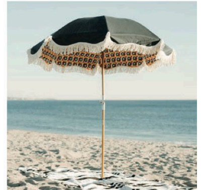
• Premium Beach Umbrella, Bottle Green

For updates on new stores and restaurants, follow us on social media (@royalhwncr) or visit our website at www.royalhawaiiancenter.com/events .